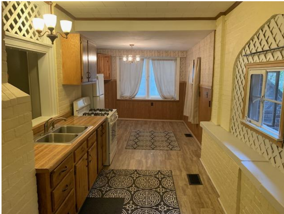
(Kitchen & Dining Area)