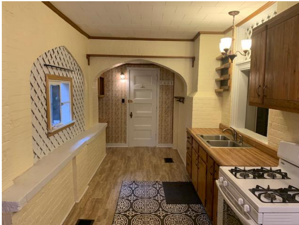
(Entryway & Kitchen)