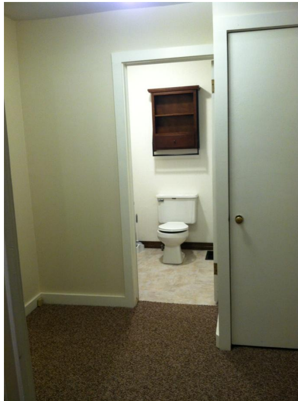
(Hallway / Bathroom)