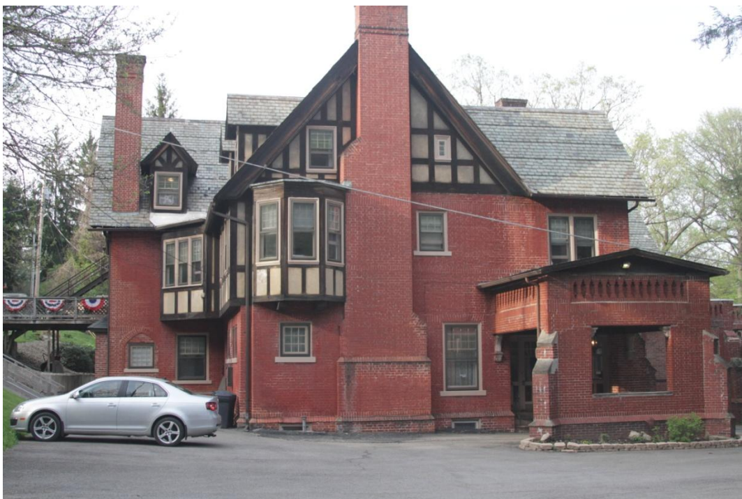
(Outside Parking/Entry View)