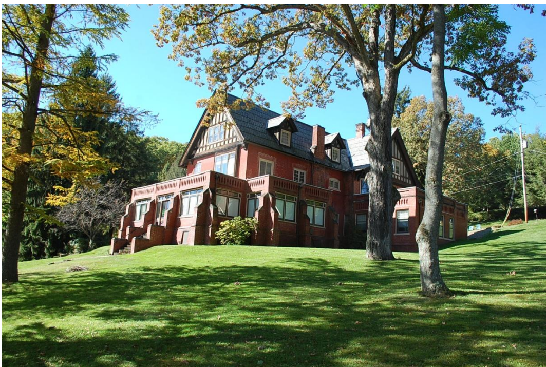
(Outside Front View)