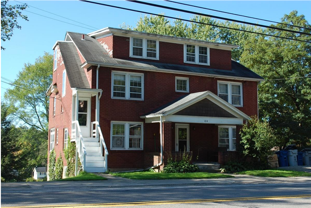
Property Street View