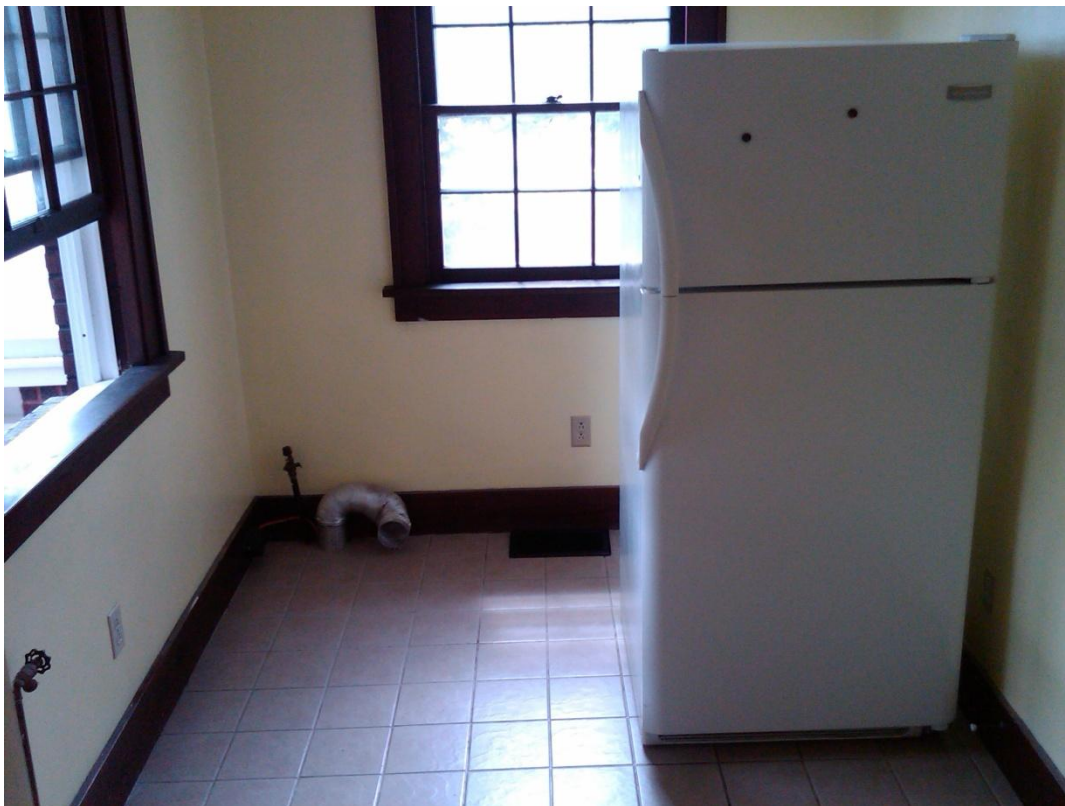
Kitchen (including Laundry hook-ups)