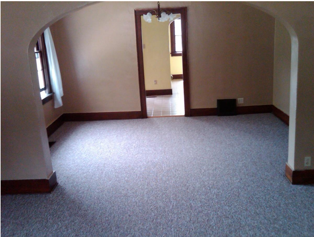
Living & Dining Rooms