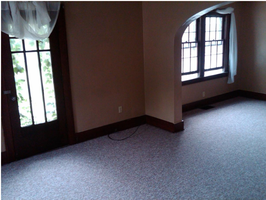
Living & Dining Rooms